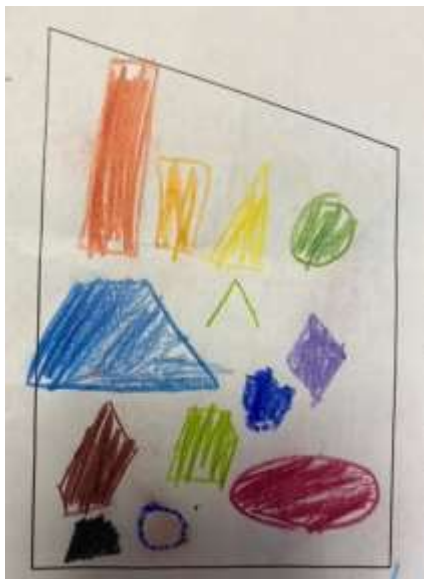
Nuhan – Emerald Class