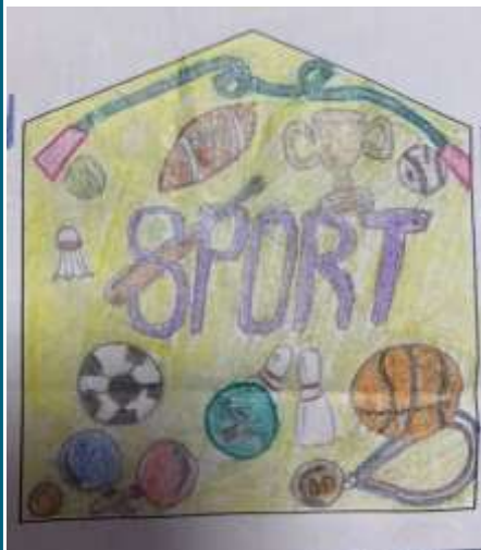
Nesheli – Turquoise Class