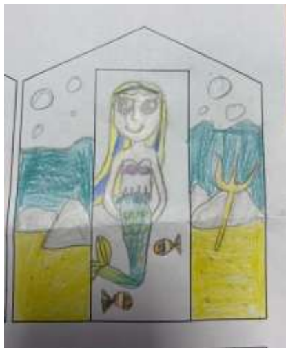
Freddy – Sapphire Class