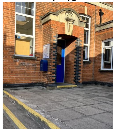
4. You can still reach the school office through the normal door but only from the car park