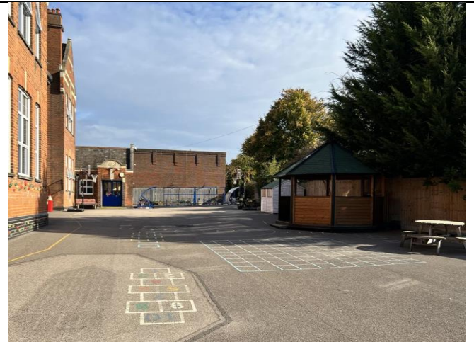
12. The side playground will be open.