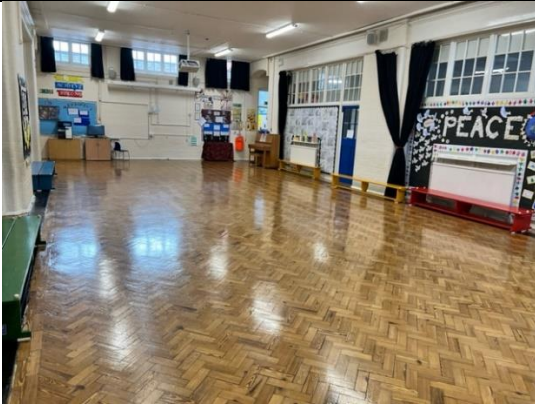
13.The hall will be used for all the dinners