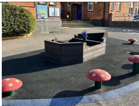
5. The boat is going to be removed and then returned