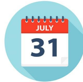
16.This will be in place until the end of July 2023.