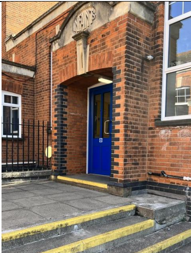
11. Jeffers Class door will be closed