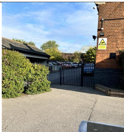
3. The car park gate will be still open