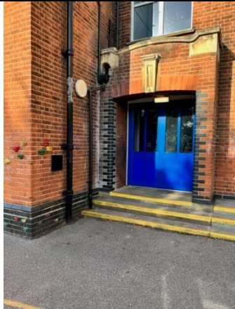
9. The blue middle doors will be open