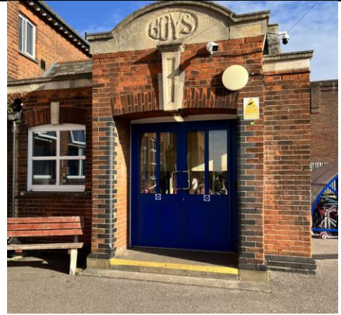
8. The top blue doors will be open as normal