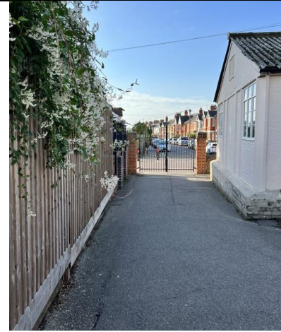
14.The double gates will be open for Years 3, 4, 5, 6 and anyone with mobility needs.