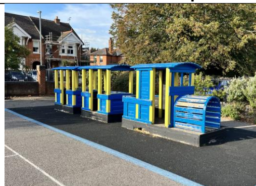
6. The train is going to be removed and then returned