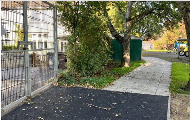
15.The field gate will be for EYFS, Year 1 and Year 2