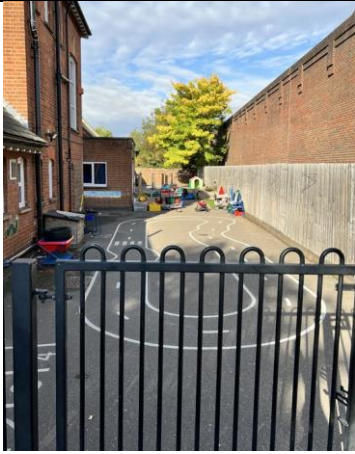
7. The EYFS access will be open as normal