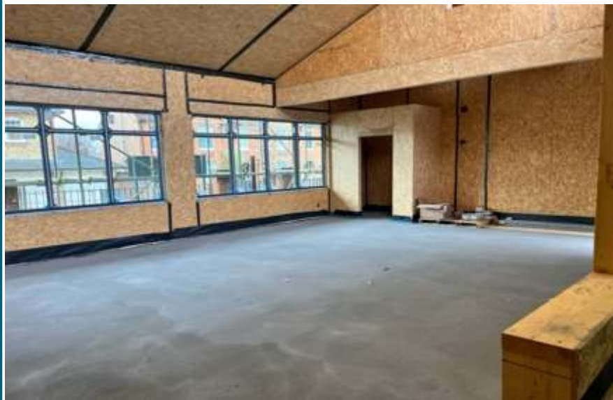
This is one of the new classrooms.